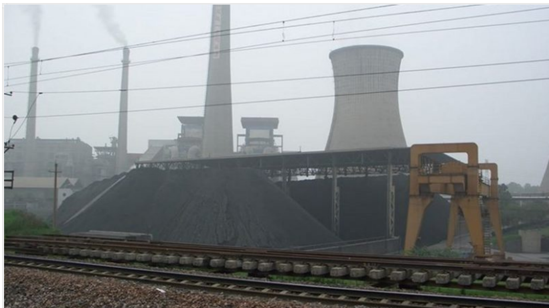
An operating coal power plant in China.