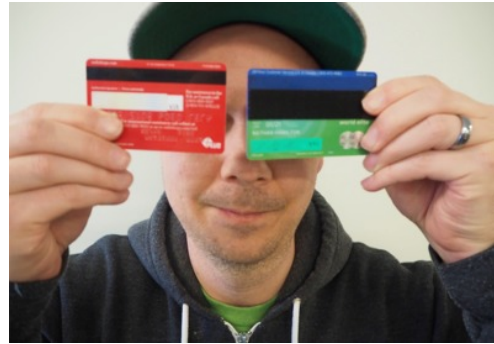
#1 Cash Back Credit Card Has a Surprise Bonus The Ascent