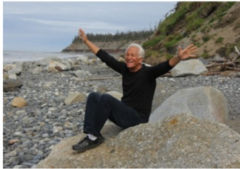
Motley Fool Issues Rare "All In" Buy Alert The Motley Fool