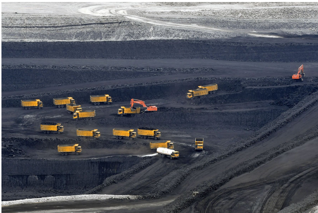
Transport trucks transfer raw coal in pits in Changji Hui Autonomous Prefecture, China.