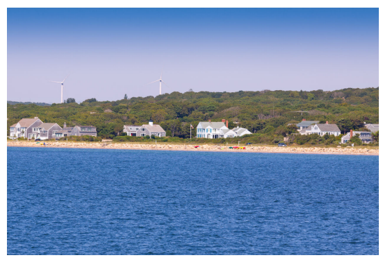
Wind turbines near homes in Falmouth, Cape Cod, Massachusetts.

By The Editorial Board Feb. 4, 2019 7:19 p.m. ET