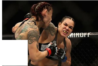
UFC Star Brutalizes Her Opponent In