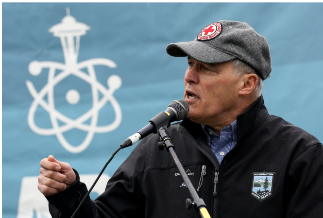
Washington Governor Jay Inslee speaks during a rally at the beginning of the March For Science in Seattle, Washington, U.S. April 22, 2017.

However, Washington voters rejected the carbon tax measure in the November election despite Inslee's support. It was the second time in two years that Washington voters rejected a carbon tax ballot initiative.