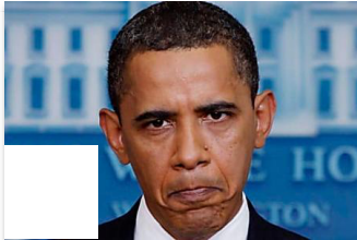
Court Axes Obama's Pro- Union 'Joint