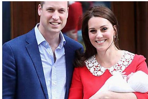
[Photos] Everyday Things Kate Middleton Isn't Allowed To Do Anymore PostFun