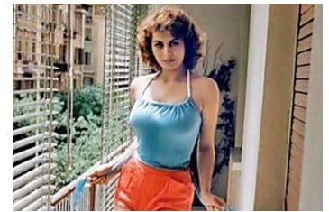
60 Vintage Photos Not Suitable For Audiences Today Groovy History