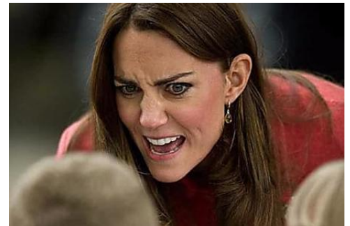
15 Times Cameras Caught Kate Middleton Off Guard