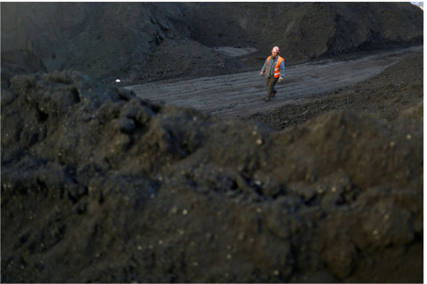
FILE PHOTO: A worker walks past coal piles at a coal coking plant in Yuncheng, Shanxi province, China January 31, 2018.

PARIS - Even as China struggles to curb domestic coal-fired power and the deadly pollution it produces, the world's top carbon emitter is aggressively exporting the same troubled technology to Asia, Africa and the Middle East, an investigation by AFP has shown.