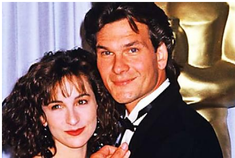
The Real Reason She Couldn't Stand Patrick Swayze [Photos] Past Factory