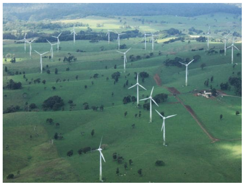
Wind turbines outside Ravenshoe, Queensland.