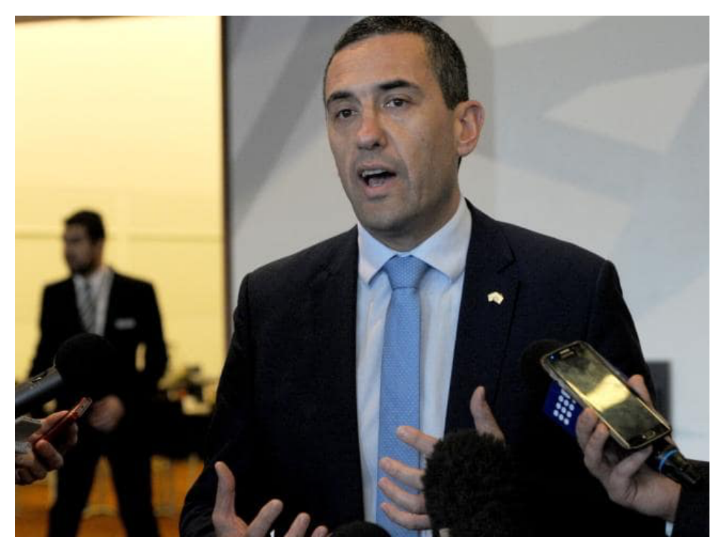
South Australia's Energy Minister has warned of disruption to other state power supplies.